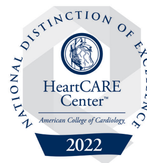
Carson-Myre Heart Center: National Distinction of Excellence

Approximate number of patients seen annually