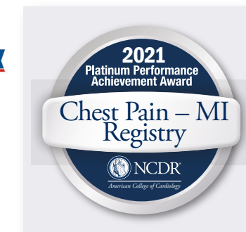
NCDR Chest Pain – MI Registry™ Platinum Performance Achievement Award