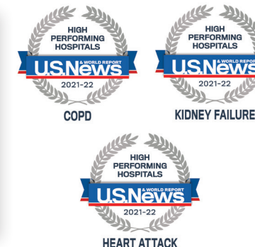
U.S. News Ranked Hospital