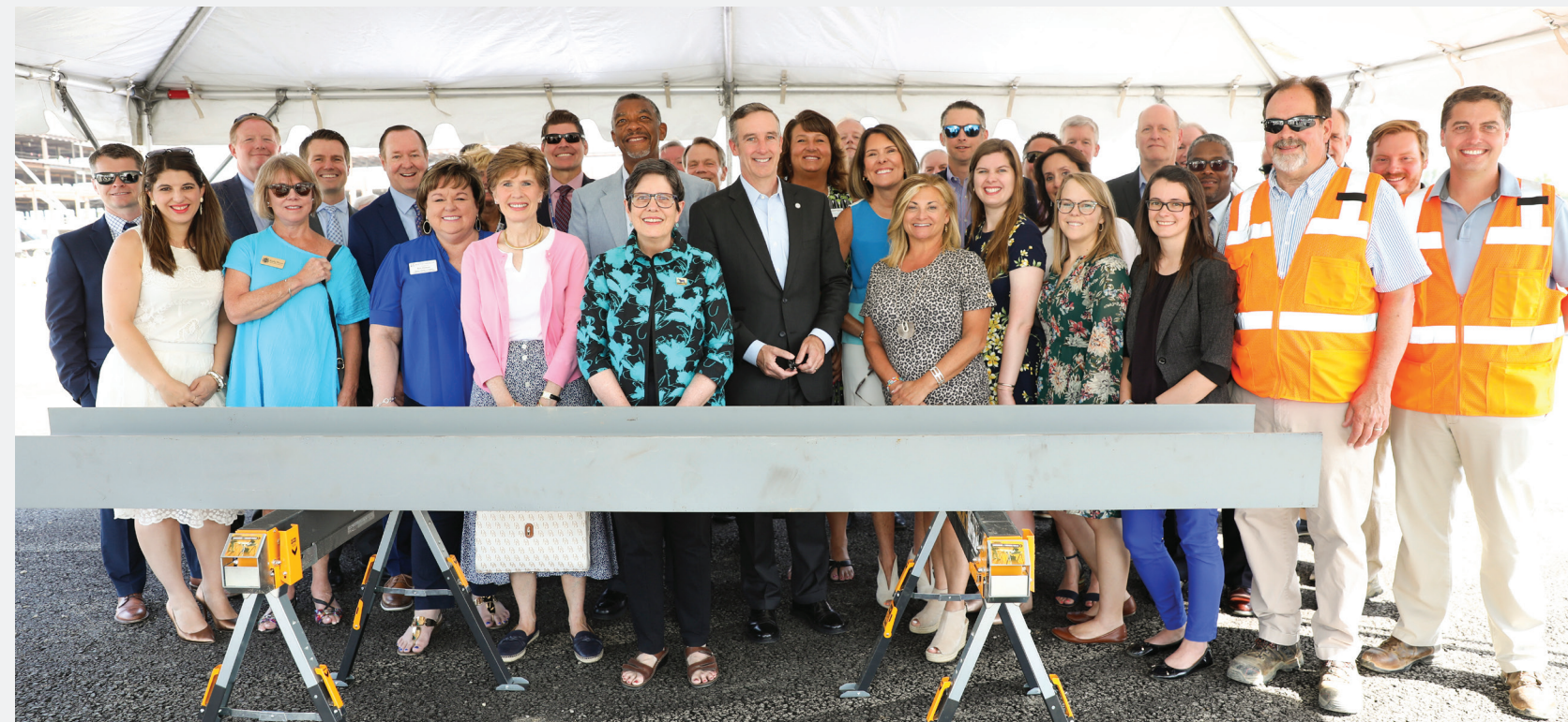
Baptist Health Foundation Lexington team, board members and community leaders, including Mayor Linda Gorton, gathered on June 21, 2022, to celebrate the placing of the commemorative last beam at Baptist Health Hamburg.

Baptist Health Hamburg is a $1 billion medical campus under construction along the Interstate 64 and Interstate 75 corridor on Lexington’s northeast side. Through multiple phases, this project includes a multistory hospital and emergency department, an outpatient surgery center, and other retail and medical office buildings. Phase 1 of Baptist Health Hamburg is anticipated to open in spring 2024 with an outpatient facility.