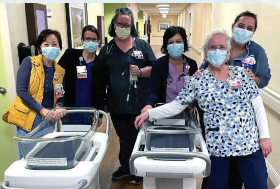
Mother & Baby Care staff with new bassinets made possible by generous donors.